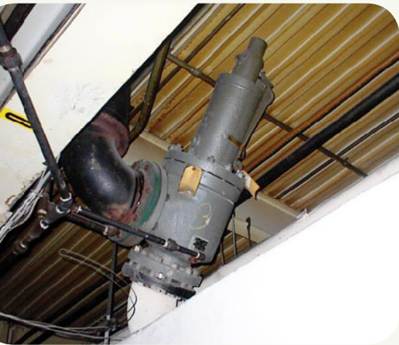
Safety valve is not installed vertically.