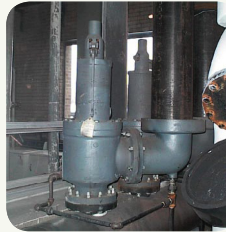
A proper safety valve installation with a drip pan elbow and proper drain lines off the safety valve and drip pan elbow.