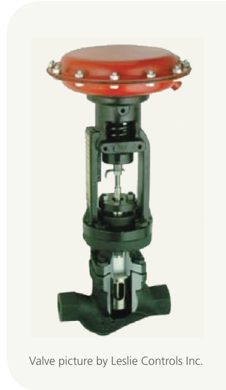
Valve picture by Leslie Controls Inc.