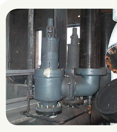
A proper safety valve installation with a drip pan elbow and proper drain lines off the safety valve and drip pan elbow.