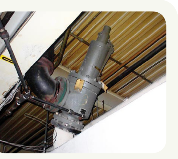
Safety valve is not installed vertically.